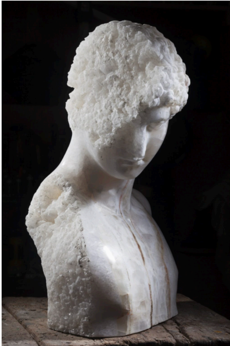
Portrait Bust, 21stC. White Marble, 45 x 40 x 20 cm